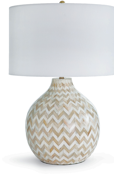
Chevron Bone Table Lamp (Natural) 13-1201